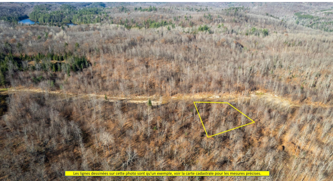
Les lignes dessinées sur cette photo sont qu'un exemple, voir la carte cadastrale pour les mesures précises.