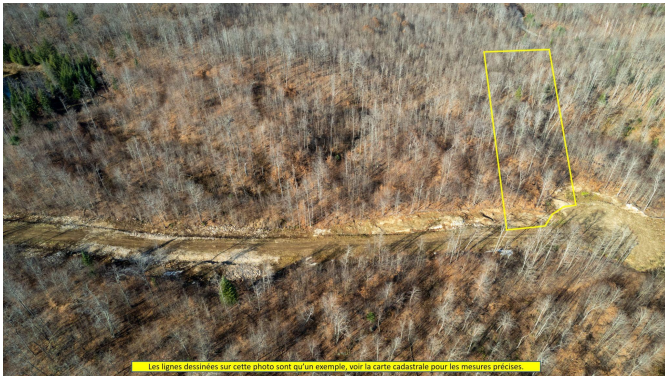
Les lignes dessinées sur cette photo sont qu'un exemple, voir la carte cadastrale pour les mesures précises.